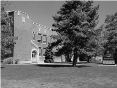
Burroughs School 2404 South Avenue, Toledo

You'll be glad you did! So will the children of Burroughs School.